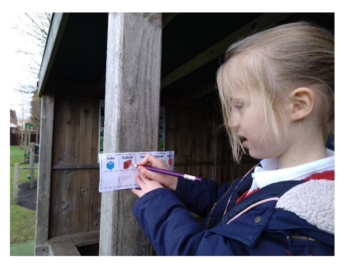
Seahorse class have really enjoyed learning about 3D shapes.