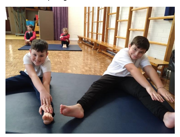
Warming up in PE