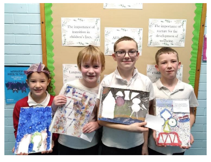
Showing off our Banksy inspired art