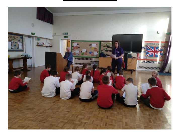
Preparing for the Eskdale Festival.