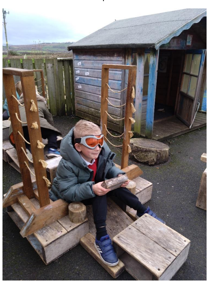
Some children chose to apply their knowledge of 3D shape during some outdoor play.