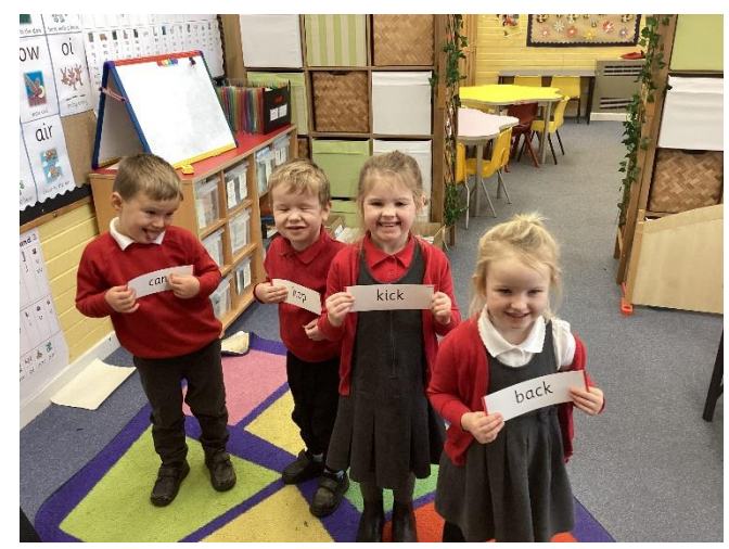
We have been working so hard in our Little Wandle phonics lessons.