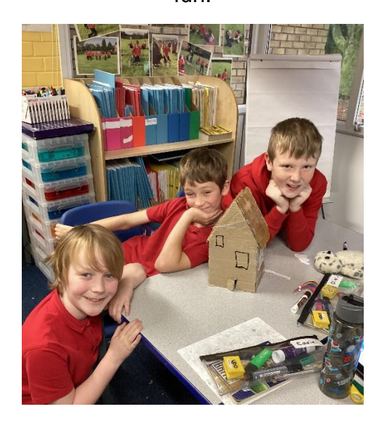
We designed our own edible Christmas houses in DT.