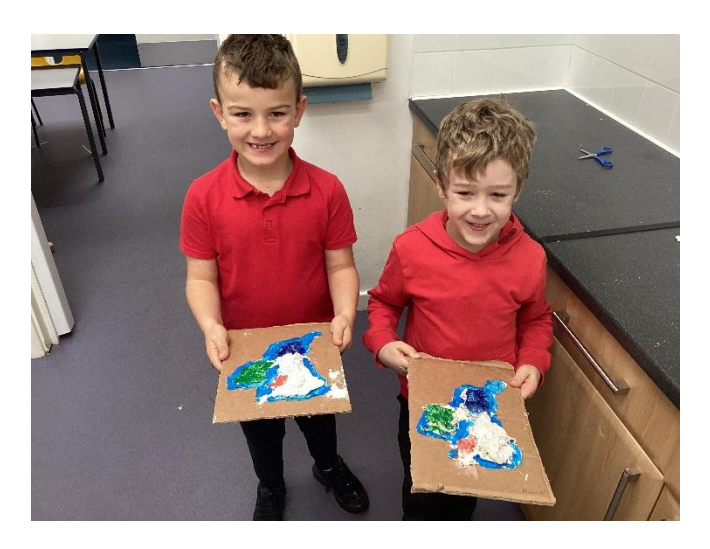
They enjoyed painting their 3D maps to help them remember the constituent countries of the United Kingdom and Northern Ireland.