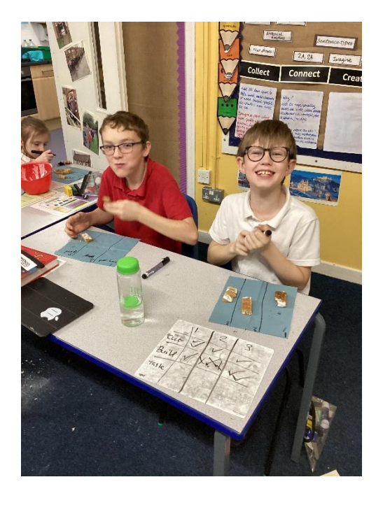
Evaluating the taste and texture of 3 different gingerbread recipes was probably the highlight of this week!