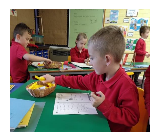
Year 2 have been learning addition and subtraction with 2-digit numbers.