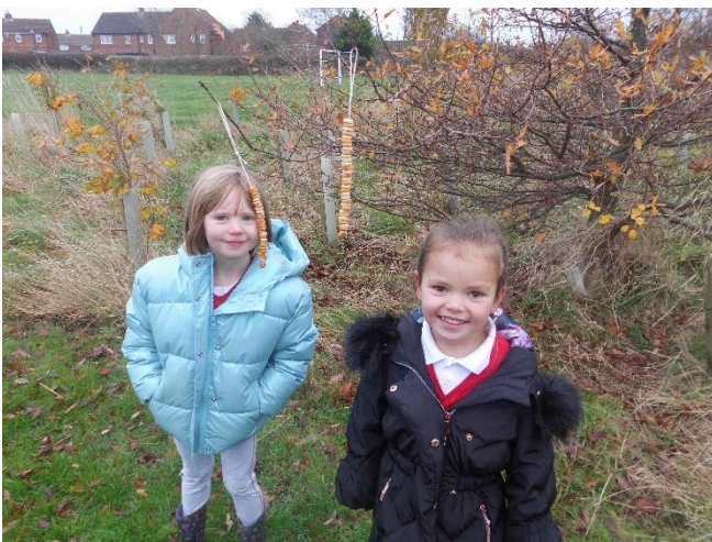
These children found a great spot to hang them.