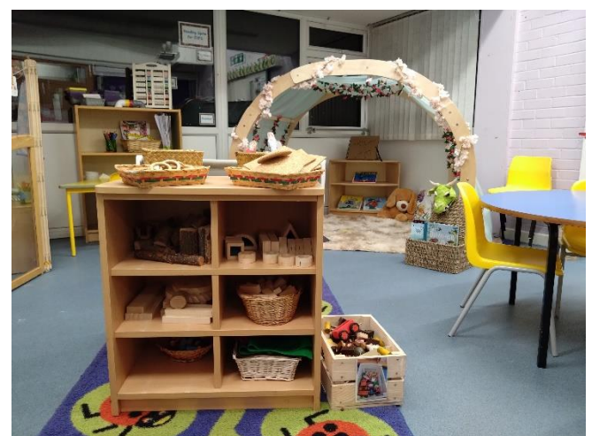
Small world with construction materials on the other side.