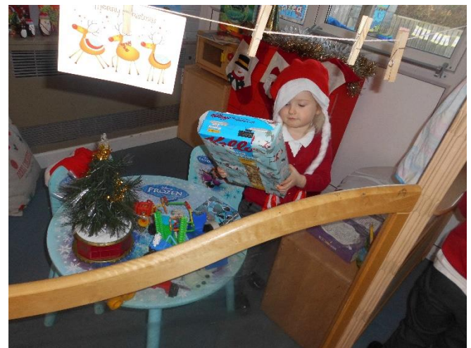
The Christmas themed home corner where the stockings are hung with care.