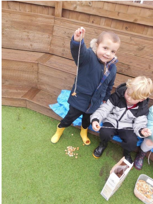
The children in EYFS have loved making bird feeders.