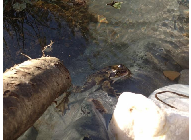
The pond received a croak of approval.

I'm incredibly excited about the pond taking centre-stage in our new Garden School curriculum.