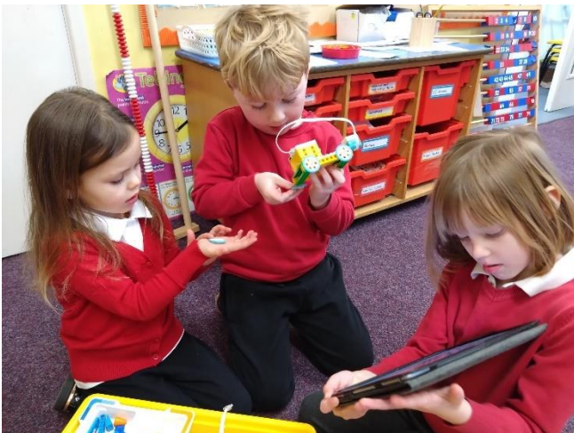
Teamwork in action!