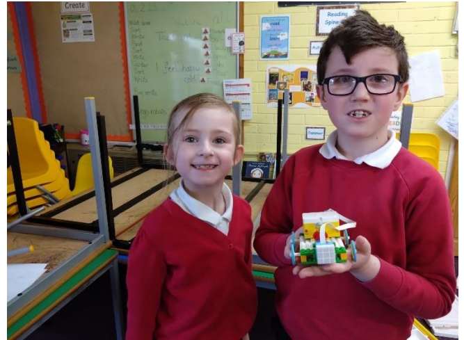
Taking pride in their work.

Both classes had brilliant workshops with Robot Education learning how to code Lego Robots.