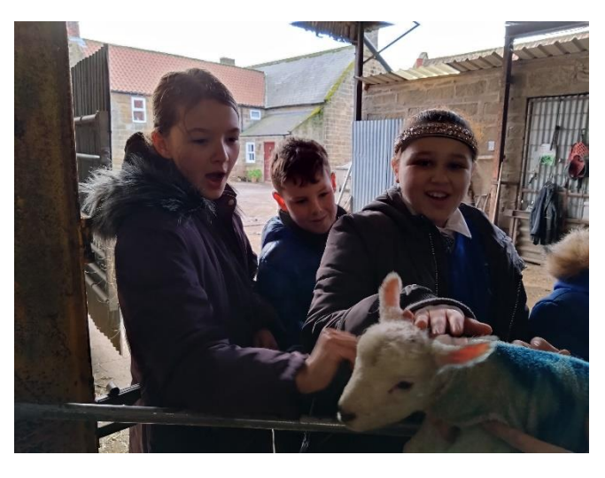
The opportunity to get up close to the lambs was a huge highlight for the children.