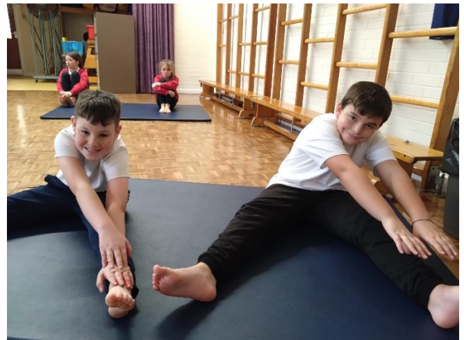
Warming up in PE