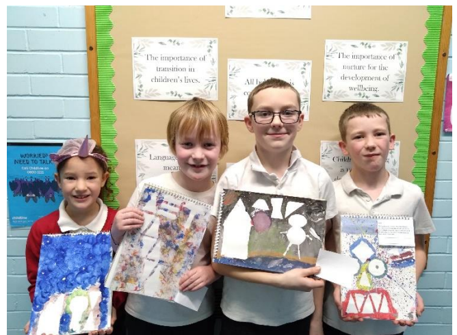
Showing off our Banksy inspired art