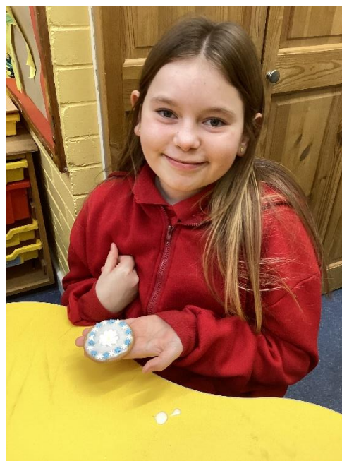
They also decorated biscuits to take home.