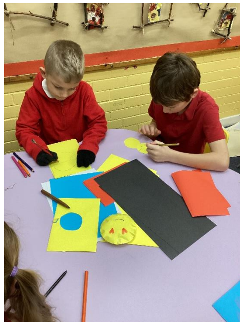
The children made their very own squishy toys.

Lots of exciting things have been happening at breakfast club.