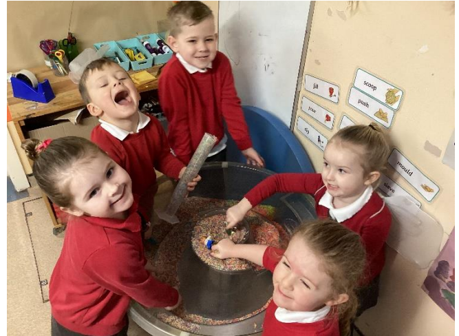
Children in EYFS love sensory exploration in their rainbow coloured rice.