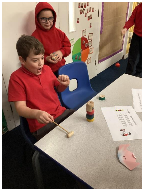
They played a traditional Japanese game and made an origami dog too.