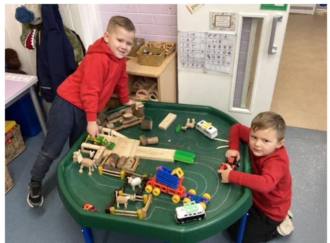
In our small world area we have been making farms in preparation for our trip to the farm.