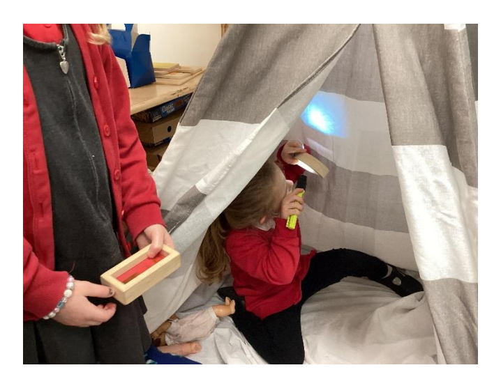
Exploring light and colours.